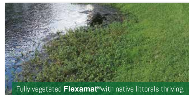
Fully vegetated Flexamat ® with native littorals thriving.