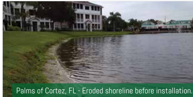
Palms of Cortez, FL - Eroded shoreline before installation.

Flexamat ® enhances safety of both the community and maintenance crews. Steep eroded banks are hazardous to maintain and it can be dangerous to even walk along the shoreline. Flexamat ® provides a stable walking surface for canoers, kayakers, and other water enthusiasts.