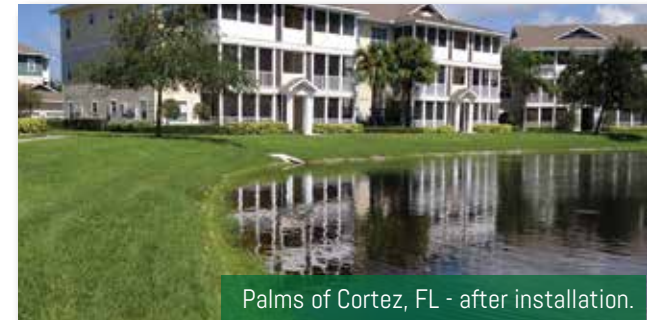
Palms of Cortez, FL - after installation.