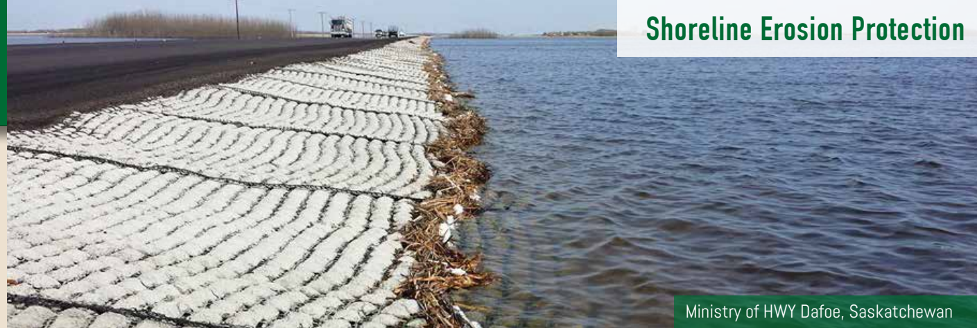
Ministry of HWY Dafoe, Saskatchewan

Flexamat ® was initially developed to stop shoreline erosion. It permanently stops erosion, while aesthetically conforming to the landscape. Flexamat ® stops erosion caused by waves, as well as erosion caused by the burrowing of nutria or muskrats. Flexamat ® also prevents erosion caused by fish, such as Tiliapia.