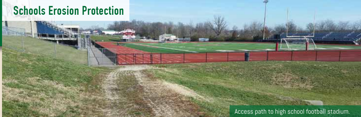
Access path to high school football stadium.

Schools typically have large buildings and parking lots that create considerable storm water runoff. These impervious surfaces make storm water outlets, drainage ditches and detention/retention areas necessary. These highly concentrated flows compounded with frequent disturbance by maintenance equipment lead to erosion issues. Flexamat® offers a permanent erosion solution for all of these areas.