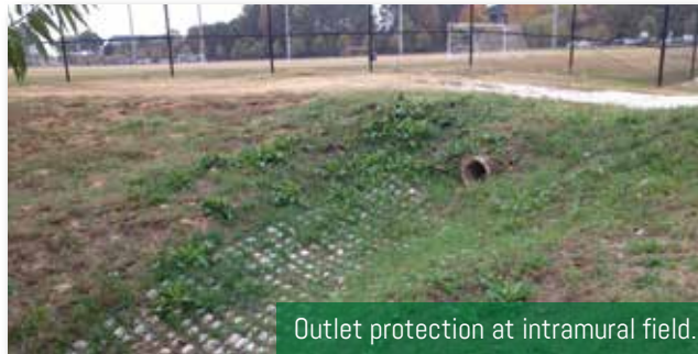
Outlet protection at intramural field.

Flexamat® also improves school safety for children. Ditches and retention areas around a school are a safety hazard. Flexamat® is permanently locked together and offers a soft, vegetated armor that can be safely walked across.