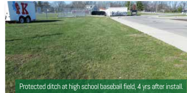
Protected ditch at high school baseball field, 4 yrs after install.