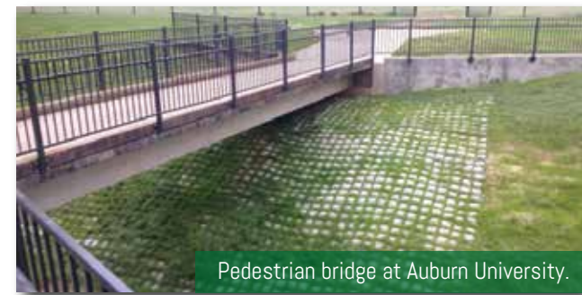
Pedestrian bridge at Auburn University.