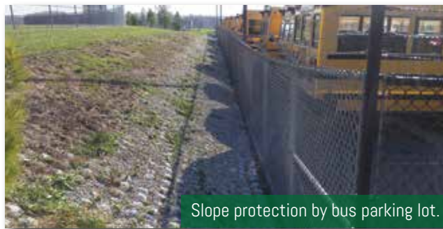
Slope protection by bus parking lot.