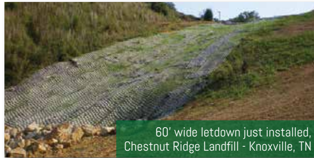
60' wide letdown just installed, Chestnut Ridge Landfill - Knoxville, TN

The transportation of materials up steep slopes is challenging and a major cost associated with the installation of Rip Rap. Flexamat ® rolls provide up to 800 square feet of material per roll, making the installation process extremely efficient.