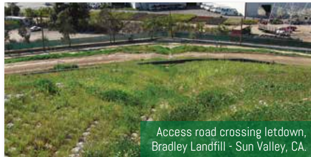
Access road crossing letdown, Bradley Landfill - Sun Valley, CA.