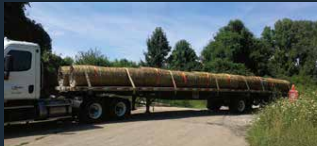
Up to 4800 square feet of material can ship on one truckload.

Flexamat® is a permanent erosion control mat utilized for stabilizing slopes, channels, low water crossings, inlet/outlet protection, and shorelines. It consists of concrete blocks (6.5" x 6.5" with a 2.25" profile) locked together and embedded into a high strength geogrid. There is 1.5" spacing between the blocks that gives the mat flexibility and allows for optional vegetation growth. The mat is packaged in rolls, making transporting and installing Flexamat® efficient.