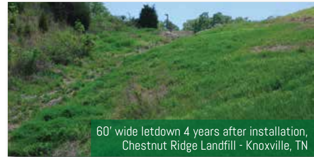
60' wide letdown 4 years after installation, Chestnut Ridge Landfill - Knoxville, TN