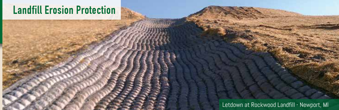
Letdown at Rockwood Landfill - Newport, MI

Flexamat ® is the solution to a common landfill drainage problem - erosion!