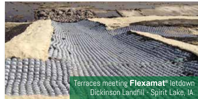
Terraces meeting Flexamat ® letdown Dickinson Landfill - Spirit Lake, IA.